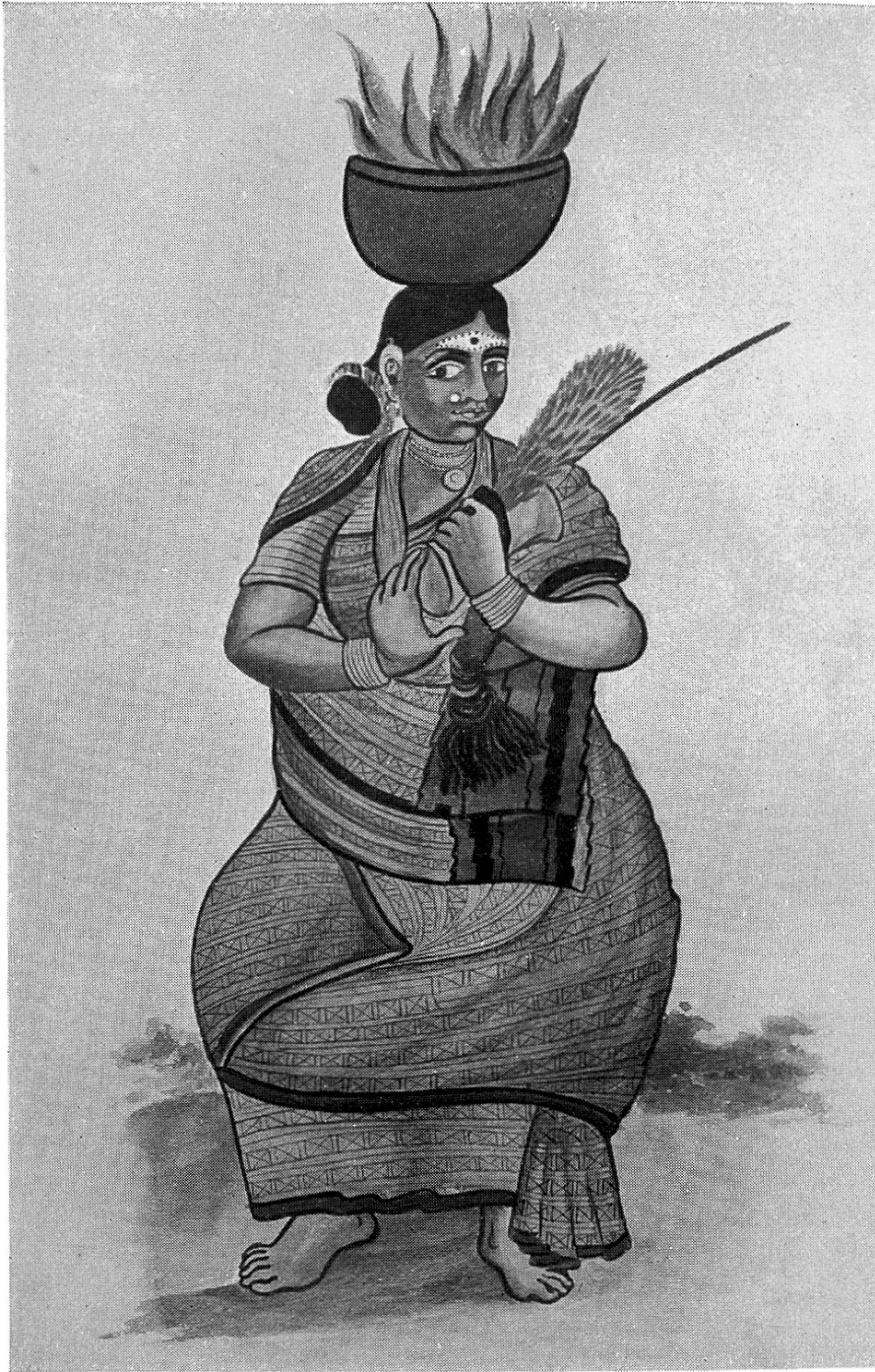
A MALABA WOMAN INVOKING THE GODDESS OF SMALLPOX AND CARRYING FIRE ON HER HEAD SYMBOLIC OF THE DISEASE